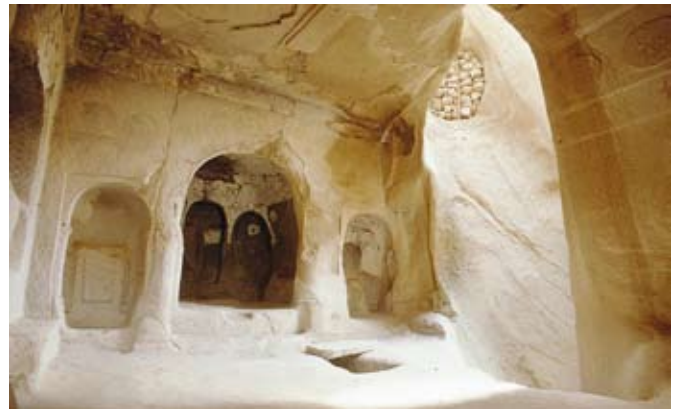
Fig. 11 - Cappadocia, Turkey.

In Italy it is possible to insert into the register of artifi-