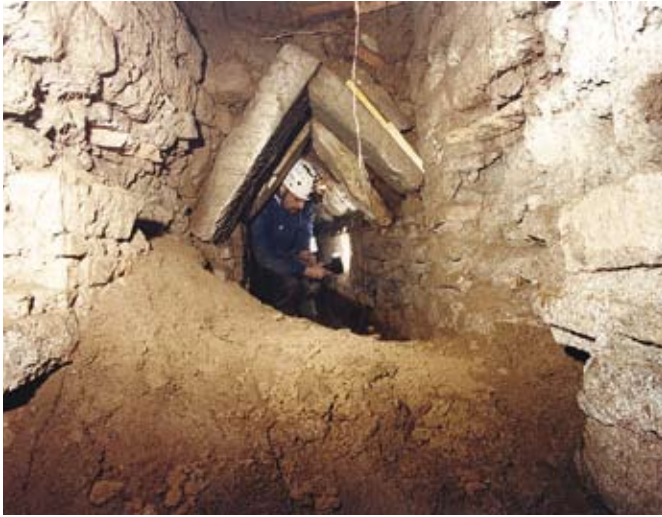
Fig. 6 - Underground stream interception of Egeria Nymphaeus, Roma.

Fig. 6 - Captazione sotterranea del Ninfeo di Egeria, Roma.