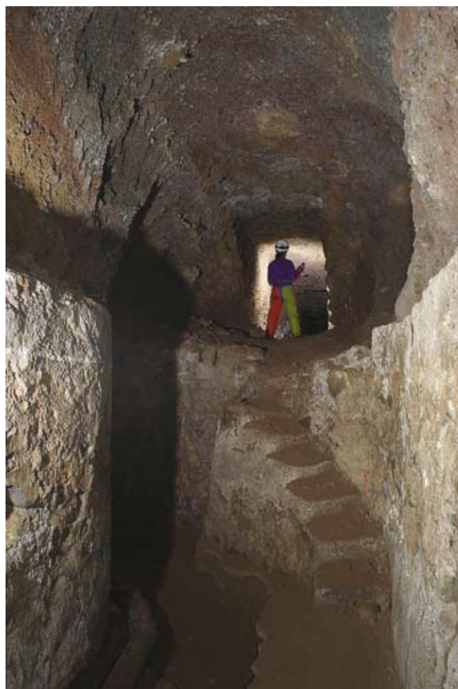
Fig. 2 - Emissary of Nemi Lake, Latium.

Fig. 1 - Insediamento permanente: Gravina di Petruscio, Puglia.