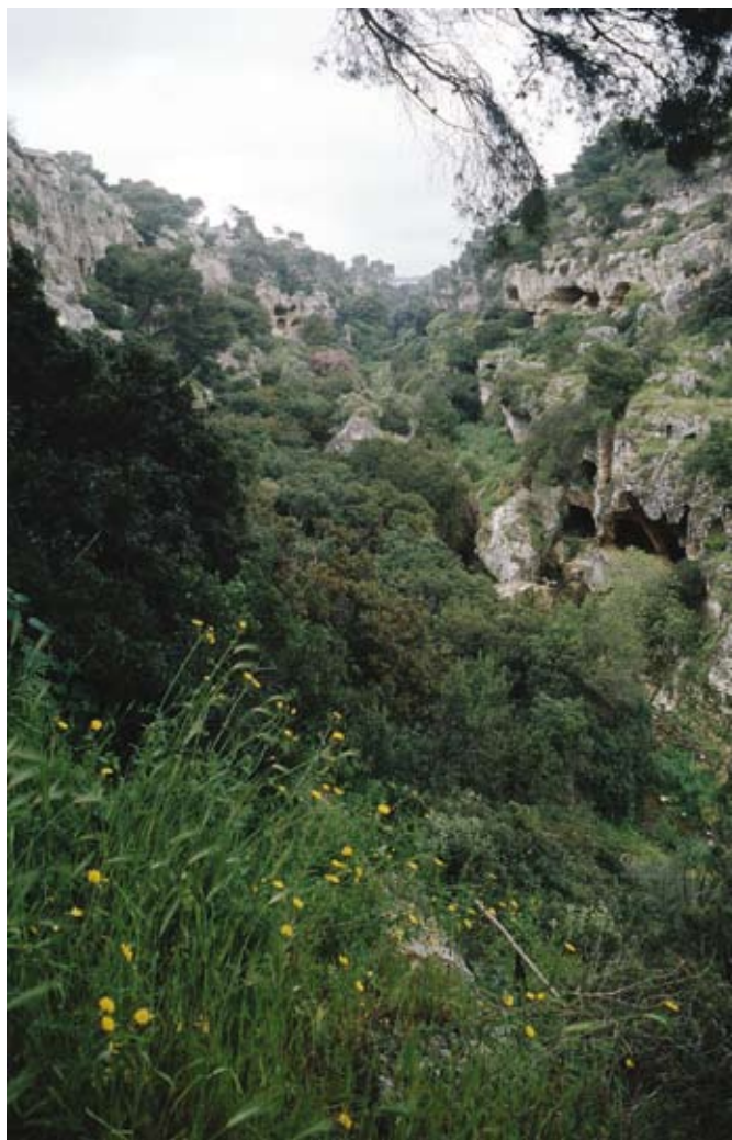
Fig. 1 - Permanent dwelling: Petruscio settlement, Apulia.

The ease of processing and utilisation of volcanic materials has allowed, since Roman times, the use of pozzolana for the construction of hydraulic mortar and of lithoid tuff as material used in construction. Therefore, stuff in the subsoil has been intensively exploited, removing the material from underground quarries and digging in the course of ages many galleries and tunnels, distributed in areas of great extent, often on multiple levels. The quarries were developed mainly in central-southern Italy, in the soft soils of tufa and pozzolana, in lithoid tuff or, more rarely, in sands and gravels.