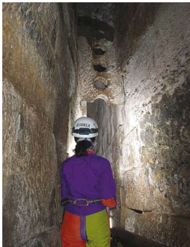
Fig. 5 - Emissary of Nemi Lake, Latium: the marble filter of Roman epoch.

Fig. 4 - L'albero tipologico delle cavità artificiali elaborato dalla Commissione Cavità Artificiali della Società Speleologica Italiana.