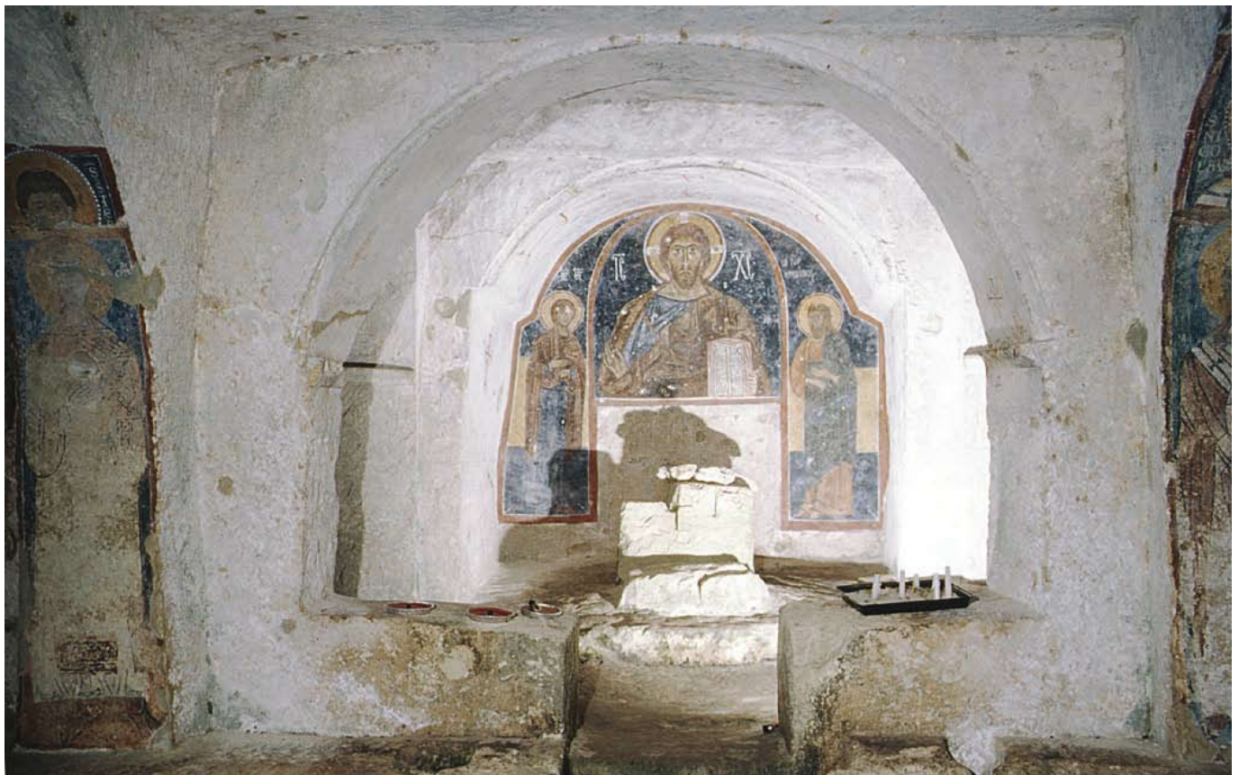
Fig. 10 - Religious/cult structure: a rupestrian church in Apulia (photo C. Germani).

The procedures to be followed to insert an artificial cavity into the register, the basic information and documentation to be delivered with the card register, are set by the National Cadastre of Artificial Cavities of