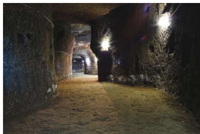
Fig. 9 - Caetani Caves: shelter (for civilian) of the War World II. Cisterna di Latina, Latium.

Galleries at least a couple of metres wide, used in the past for the transit of carriages, wagons, horses.