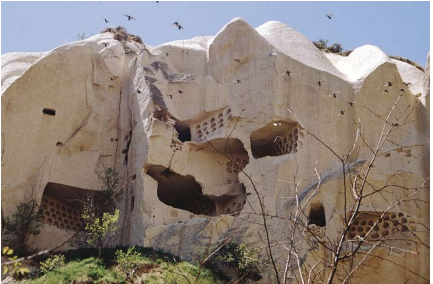
Fig. 7 - Pigeon-houses. Cappadocia, Turkey.

C.1 Nymphaeum, Mithraea (Fig. 8), temples, sacred