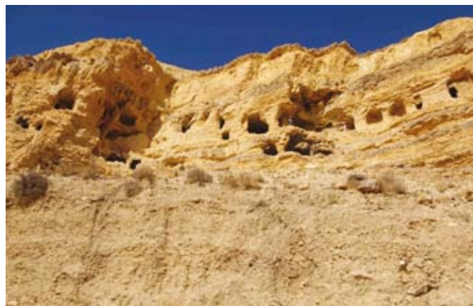
Fig. 3 - Jordan.

In Italy, conventionally, artificial cavities are the underground works of historical and anthropological interest, man-made or readjusted by man for his needs. Therefore artificial cavities are considered to include both man-made works (excavated, built underground or turned into underground structures by stratigraphic overlap) and natural caves if readjusted to human needs, at least in part. For example, the natural caves used as shelters in the Alps during the First World War, the hermitages in natural shelters, etc. Both of these sorts of underground space are included in the classification system and site-register ('cadastre').