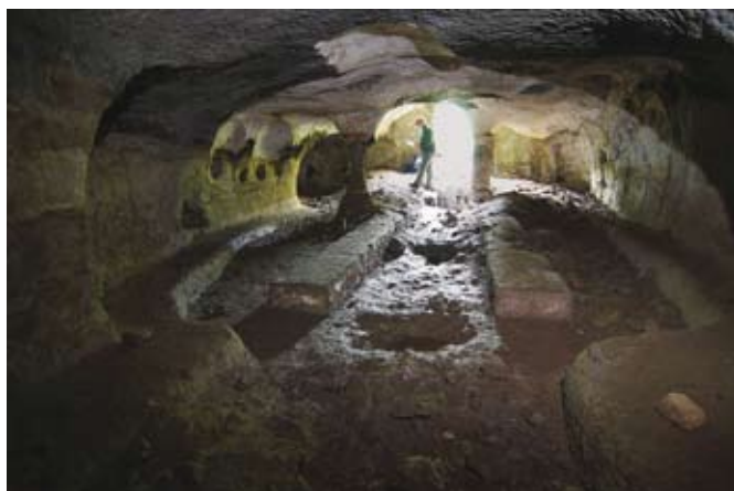
Fig. 8 - Mithraeum of St. Nicholas, Guidonia, Latium.

Fig. 8 - Mitreo di San Nicola, Guidonia, Lazio.